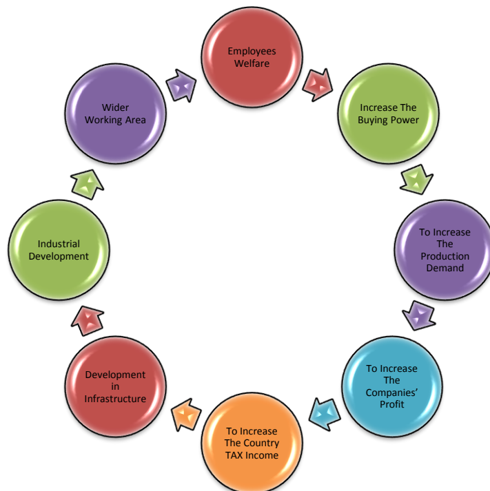
Fig. 1 The Domino Effect of The Employees Welfare