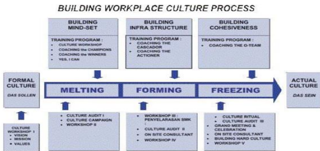
Figure 2.1: Building Workplace Culture Process

In the process of planting the culture needs to be a long and continuous process. Culture needs to lead to the creation of the mind-set of SDM college, infrastructure development and construction of cohesiveness. Besides the construction of the system which includes mindset, infrastructure and cohesiveness is also necessary to have an evaluation process. And the stages of its implementation should be maintained consistency and consistent application of the spirit as well. If these things continue to be expected that diinternalisasikan culture will be created. In the implementation of human resource management model diperguruan high, the system will not be far from the culture, therefore the development of the system will lead also to the development of culture. The application can clearly be seen in Figure 2.1 as follows: