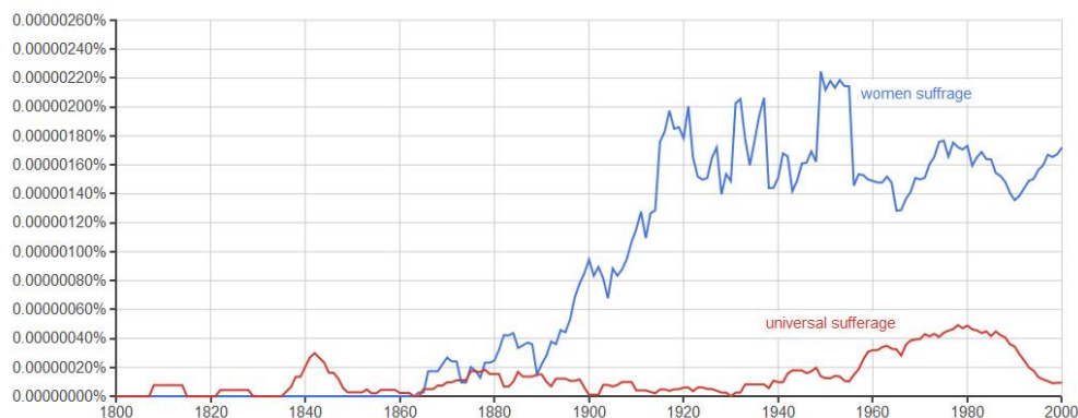
Figure 1b. N-gram 6 plot on universal suffrage vs. women suffrage

Even though Wilson's politics-administration dichotomy theory was later challenged by its contenders, e.g. Simon's (1946) fact-value dichotomy and the 'seamless web of discretion and interaction' Gulick advocated (Fry, 1989, p.80; Gulick, 1933a, p.56; Gulick, 1933b;), Wilson's theory still managed to remain as the center for study and criticism over time (Musav & Tahmasebi, 2011; Svava & Overeem, 2006, p.121). Other scholars, too, like Frank Goodnow (1900), have pointed out that politics and administration can never be completely, let alone distinctively, separated – just as the two genders could not survive on their own. As Goodnow argued (1900, p.16), 'while the two primary functions of government are susceptible of differentiation, the organs of government to which the discharge of these functions is intrusted' and so 'cannot be clearly defined.' A statement that